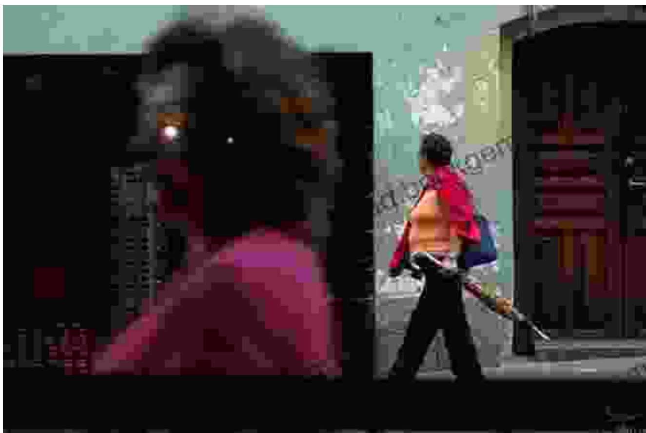
A photographer capturing the vibrant street life of Quito

As a renowned photographer, Chris Backe will guide you in capturing the essence of Quito through your lens. Learn the art of travel photography, from mastering composition to capturing the perfect light. Embark on photo walks through the historic center, capturing the architectural details, vibrant street scenes, and candid portraits of local people.