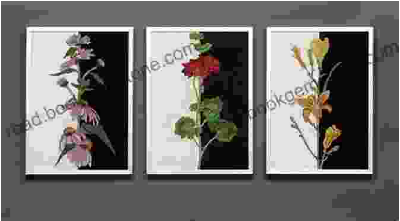
Floral Triptych No. 2 by William Powell