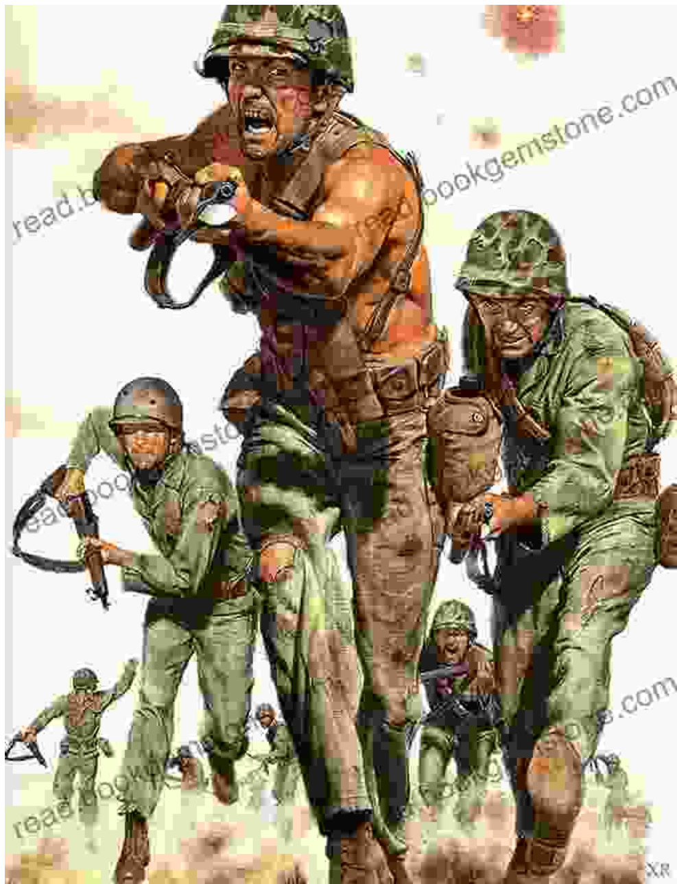
This poster was designed to encourage recruitment into the British Army.