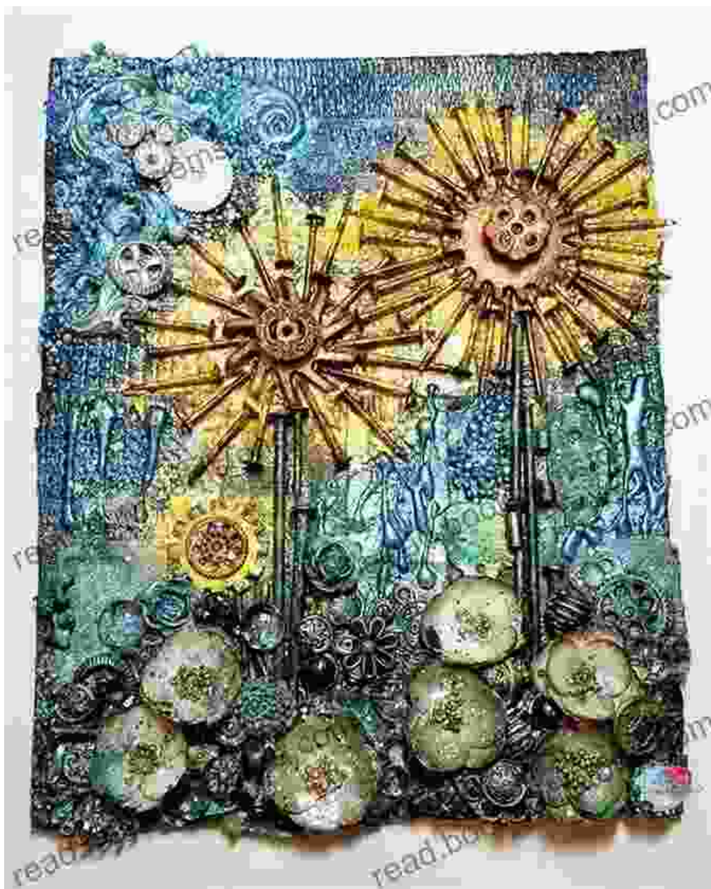
Collage and Assemblage: A Tapestry of Floral Elements

Acrylics and oils are often favored for their versatility and rich pigmentation, allowing artists to create vibrant and expressive layers of color. Pastels and charcoal, on the other hand, lend a softer, more ethereal quality to the artwork, inviting viewers to feel the velvety touch of petals and the gentle caress of the breeze.